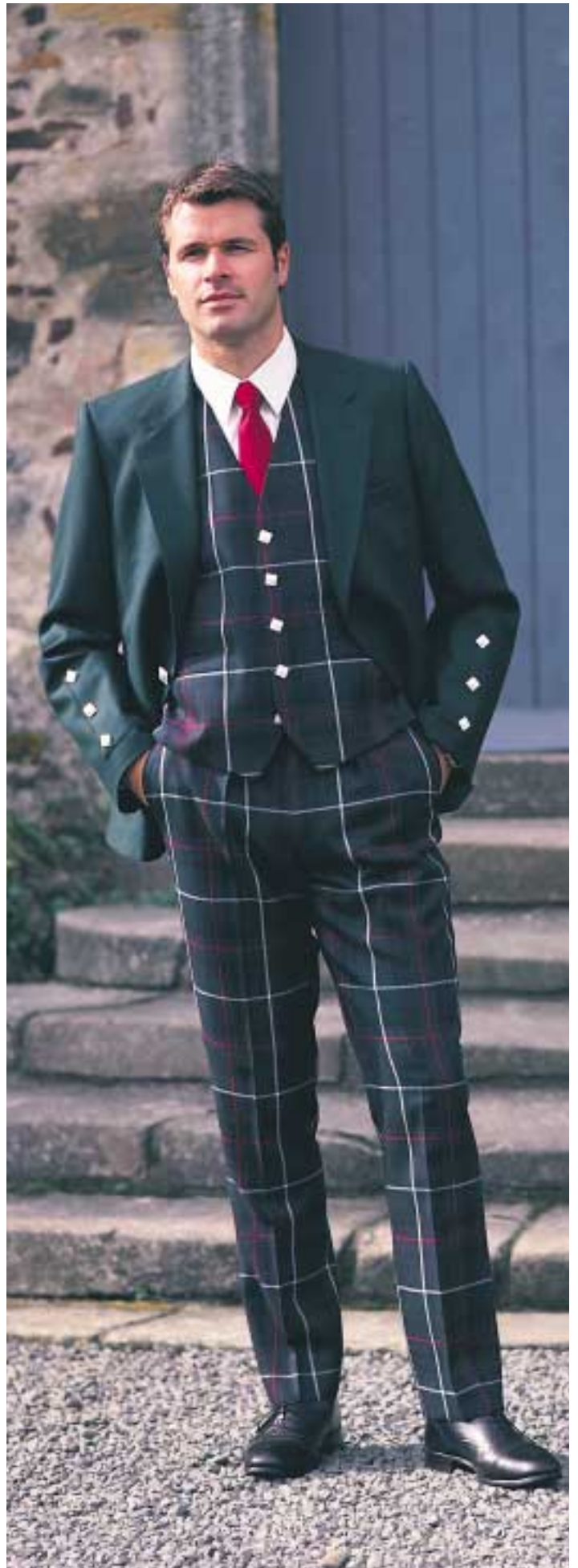
KJ/BW KINLOCH JACKET IN TARTAN GREEN WORSTED DW/TW DAY WAISTCOAT TT/SS TARTAN TROUSERS IN MACDONALD OF THE ISLES HUNTING MODERN COLOURS