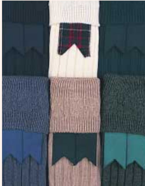
GF/P PLAIN GARTER FLASHES GF/T TARTAN GARTER FLASHES SC/H KILT HOSE