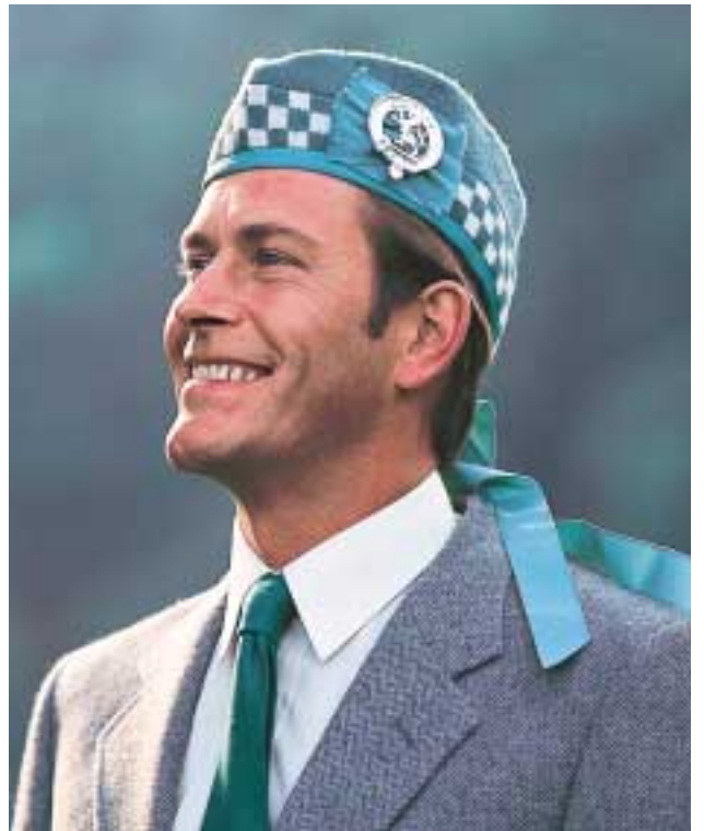
GG/DB DICED GLENGARRY IN LOVAT GREEN