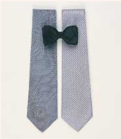
TY/W WEDDING TIES IN SILK TY/BT BLACK BOW TIE