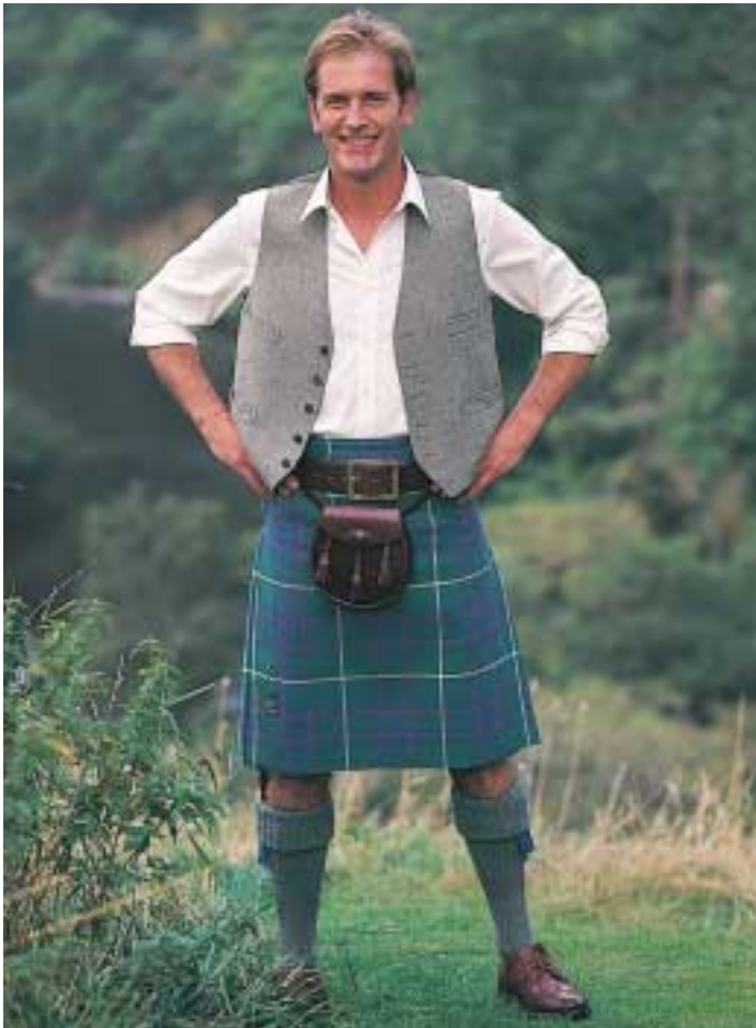
DW/GT DAY WAISTCOAT IN GREEN LOVAT TWEED KL206 KILT IN MACINTYRE HUNTING ANCIENT COLOURS