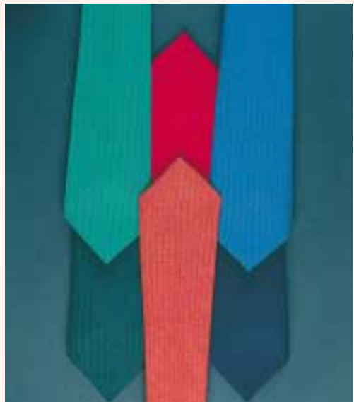
TY/PW WOOL TIES