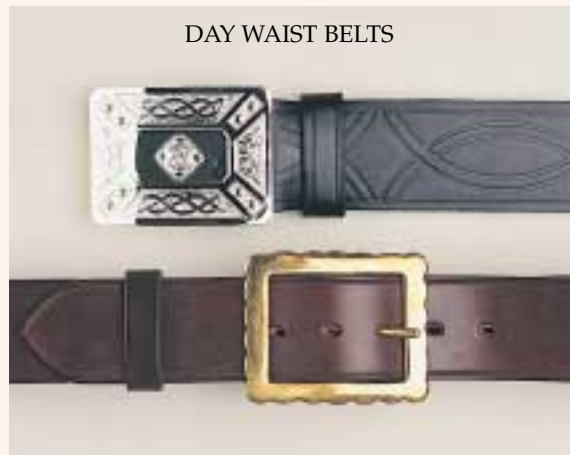
KA/B BUCKLE DB/HT BELT DB/CL BELT