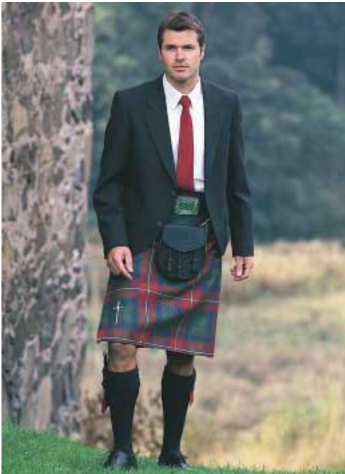
DJ/DG PLAIN DAY JACKET IN DARK GREY TWEED KL206 KILT IN ROXBURGH TARTAN