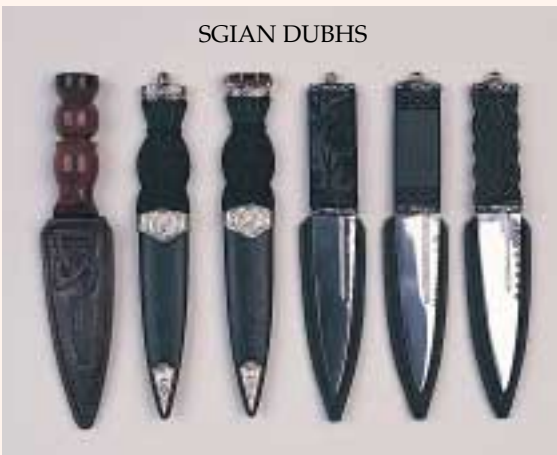
SG/69 SG/70 SG/71 SG/72 SG/73 SG/74