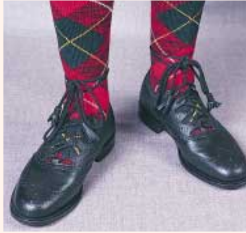
GB/SL GHILLIE BROGUES IN SOFTEE LEATHER