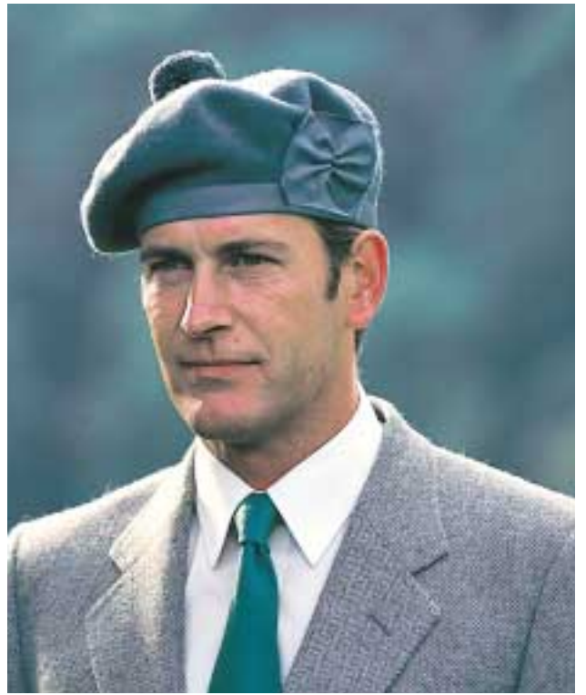
BM/PN PLAIN BALMORAL IN LOVAT BLUE