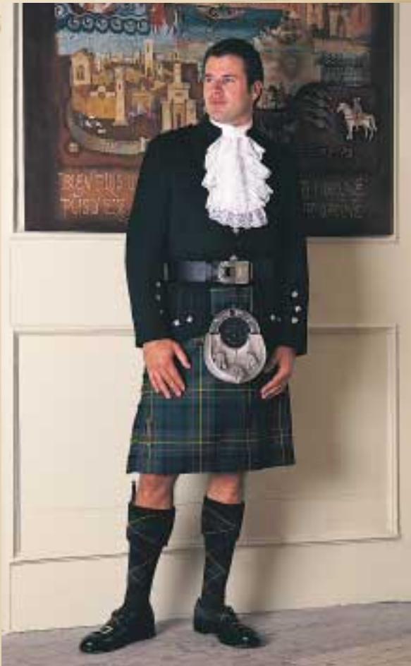
KM/BB KENMORE DOUBLET IN BLACK BARATHEA KL206 KILT IN MACLAREN MODERN COLOURS