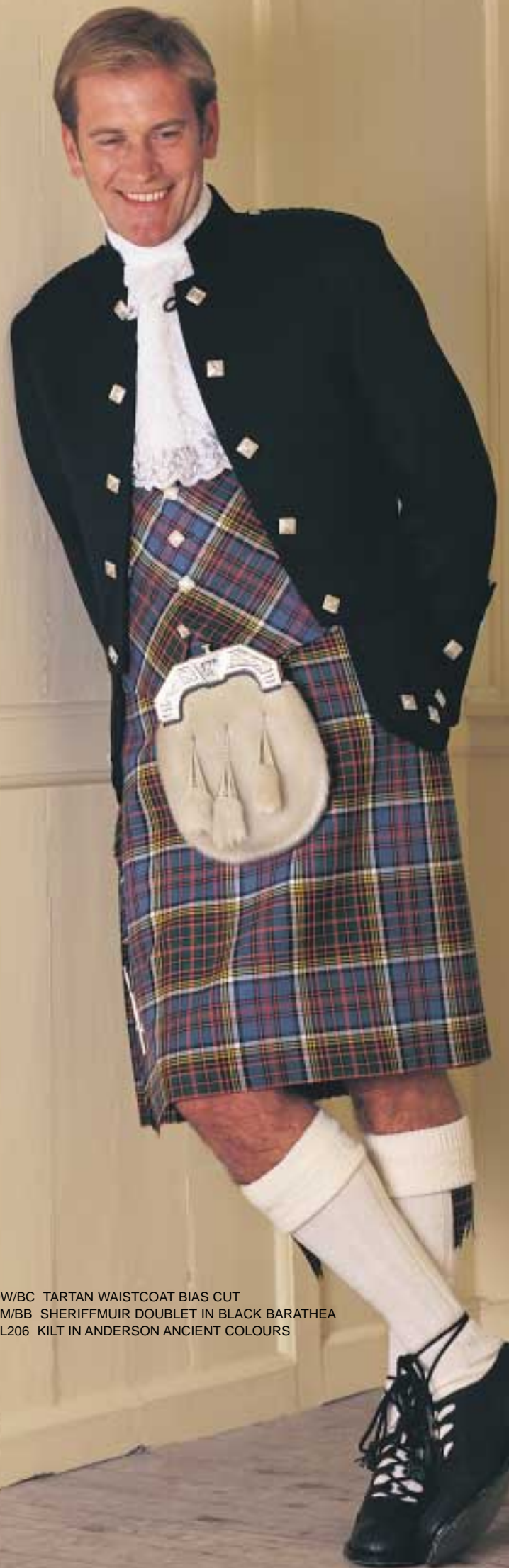
DW/BC TARTAN WAISTCOAT BIAS CUT SM/BB SHERIFFMUIR DOUBLET IN BLACK BARATHEA KL206 KILT IN ANDERSON ANCIENT COLOURS