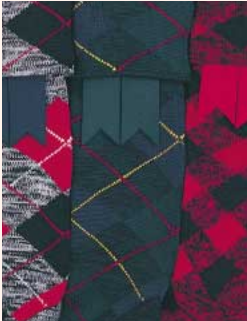
FT/H FULL TARTAN HOSE DD/H DICED HOSE