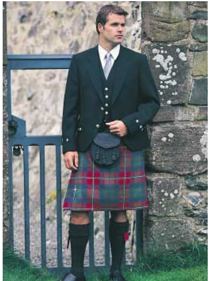
DJ/BB ARGYLL JACKET IN BLACK BARATHEA DW/BB DAY WAISTCOAT IN BLACK BARATHEA