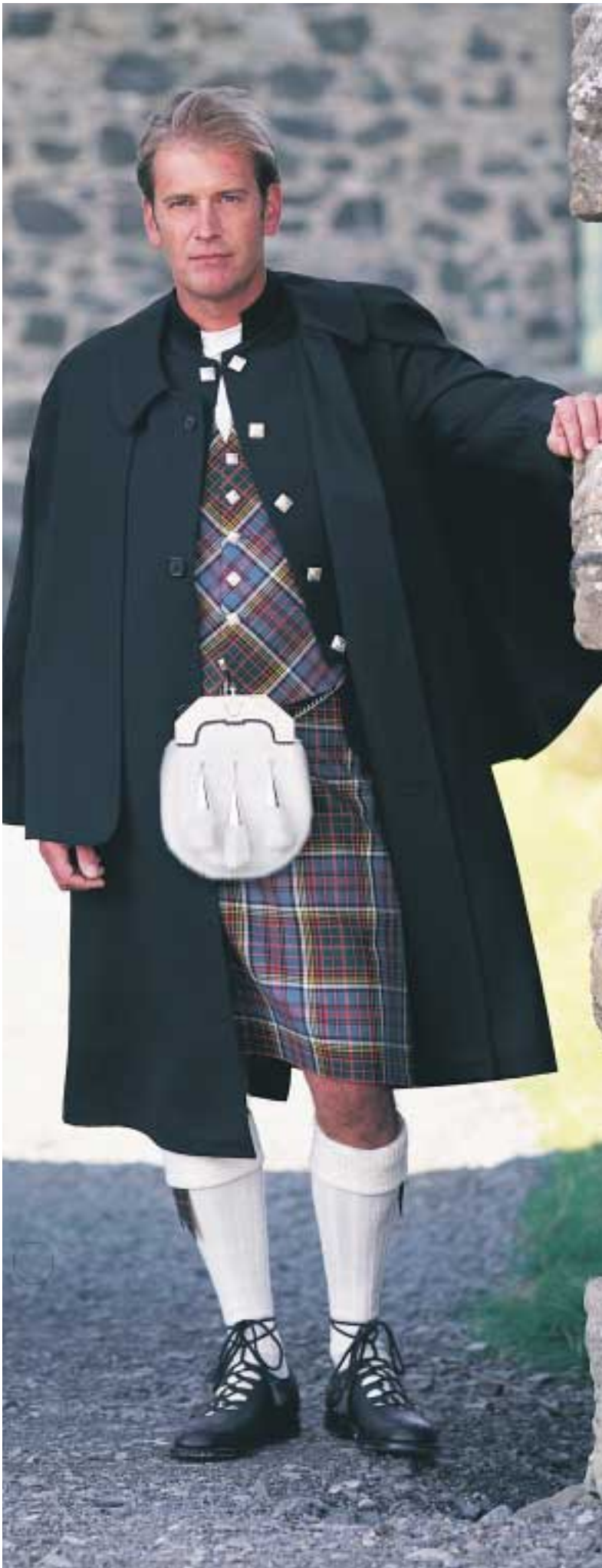
IC/BB INVERNESS CAPE IN BLACK BARATHEA