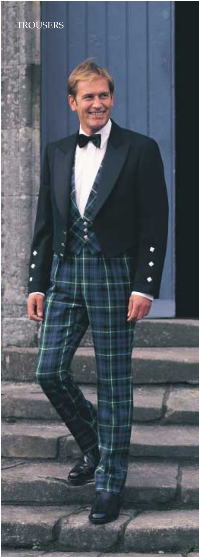
EW/BC EVENING WAISTCOAT BIAS CUT IN LAMONT ANCIENT TT/FB TROUSERS IN LAMONT ANCIENT