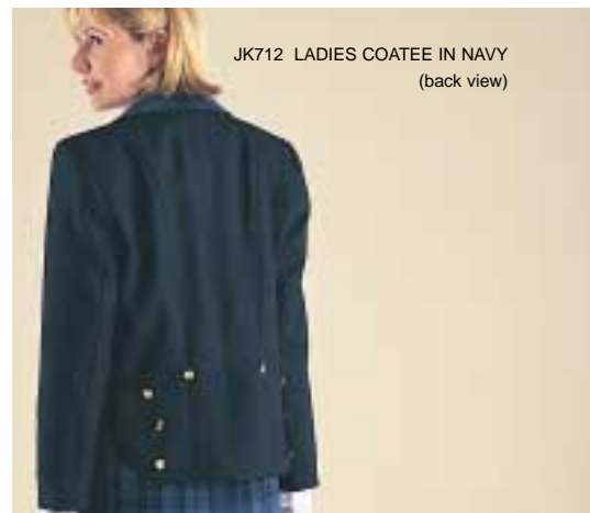
JK712 LADIES COATEE IN NAVY (back view)