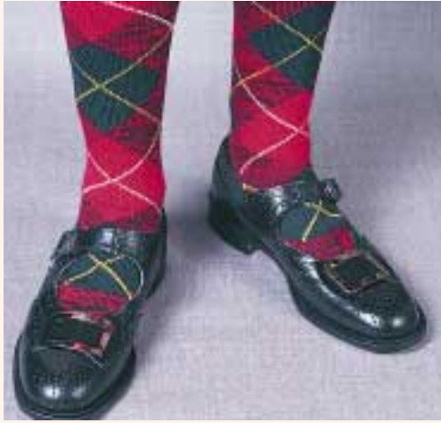
BB/GL BUCKLE BROGUES IN GLOSS LEATHER