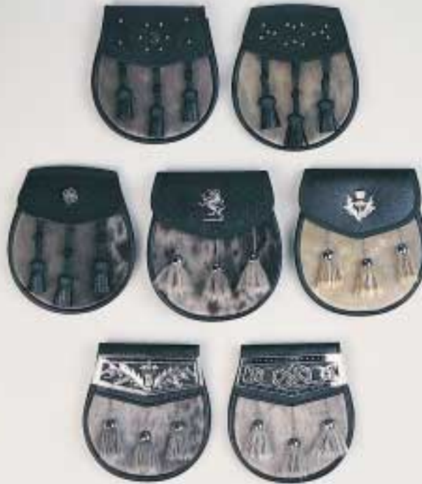
SD/57 SD/58 SD/59 SD/60 SD/61 SD/62 SD/63