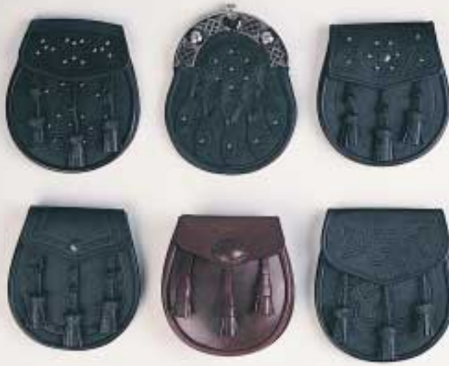
DWS/64 SD/56 DWS/65 DWS/66 DWS/68 DWS/67