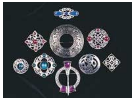
CB10 CB11 CB12 CB13 CB14 CB15 CB16 CB17 CB18