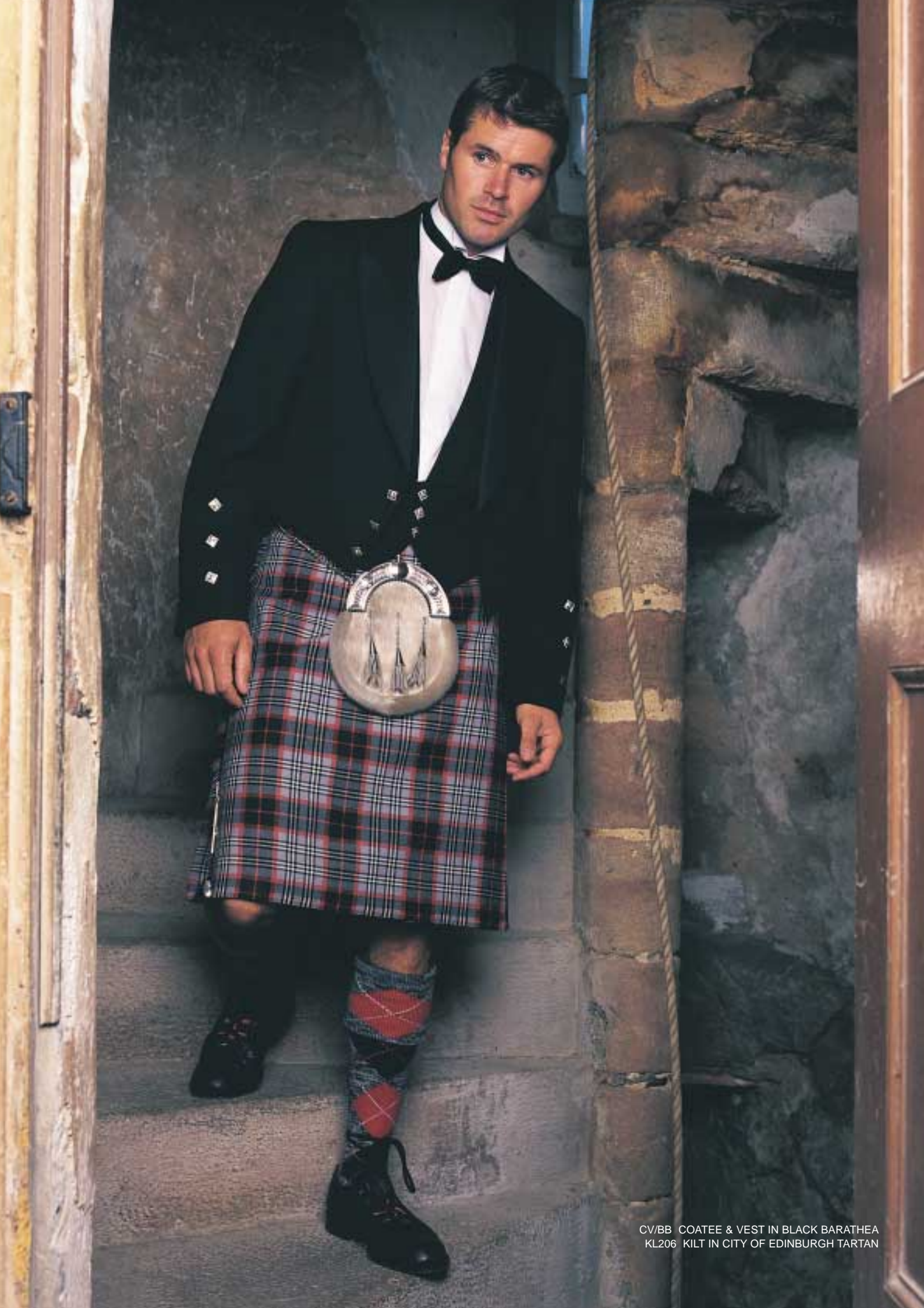
CV/BB COATEE & VEST IN BLACK BARATHEA KL206 KILT IN CITY OF EDINBURGH TARTAN