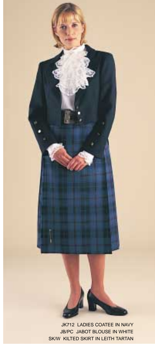
JK712 LADIES COATEE IN NAVY JB/PC JABOT BLOUSE IN WHITE SK/W KILTIED SKIRT IN LEITH TARTAN