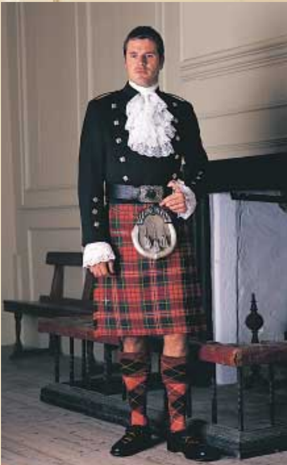
MD/BB MONTROSE DOUBLET IN BLACK BARATHEA KL206 KILT IN MACPHERSON RED MODERN COLOURS